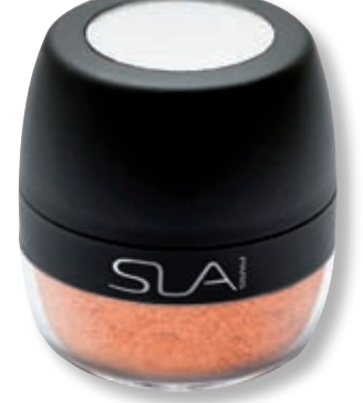
SLA Powder Blush in Peach $29.80

Fire up your hair colour for the new season but keep your makeup minimal.