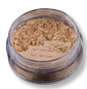
La Glam mineral power foundation in Miami $60