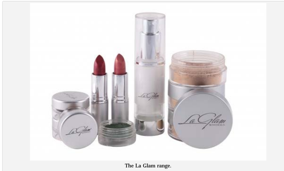
The La Glam range.

Last month I was proud to be named No1 makeup artist in Australia by the Australian Bridal Industry Academy. This month I'm excited to have been nominated for Cosmopolitan magazines Fun Fearless Female award and have made the final 10 nominees with winner to be announced later this year! I'm so honoured to have been apart of both of these awards. To be named No 1 Makeup Artist in Australia is huge, I feel so lucky that my brides acknowledge my hard work and the effort I put in for them. The Fun Fearless Female award is also such a great award to be nominated for, I love the concept of this award and I would be so honoured if I was to win this and be a role model for others.